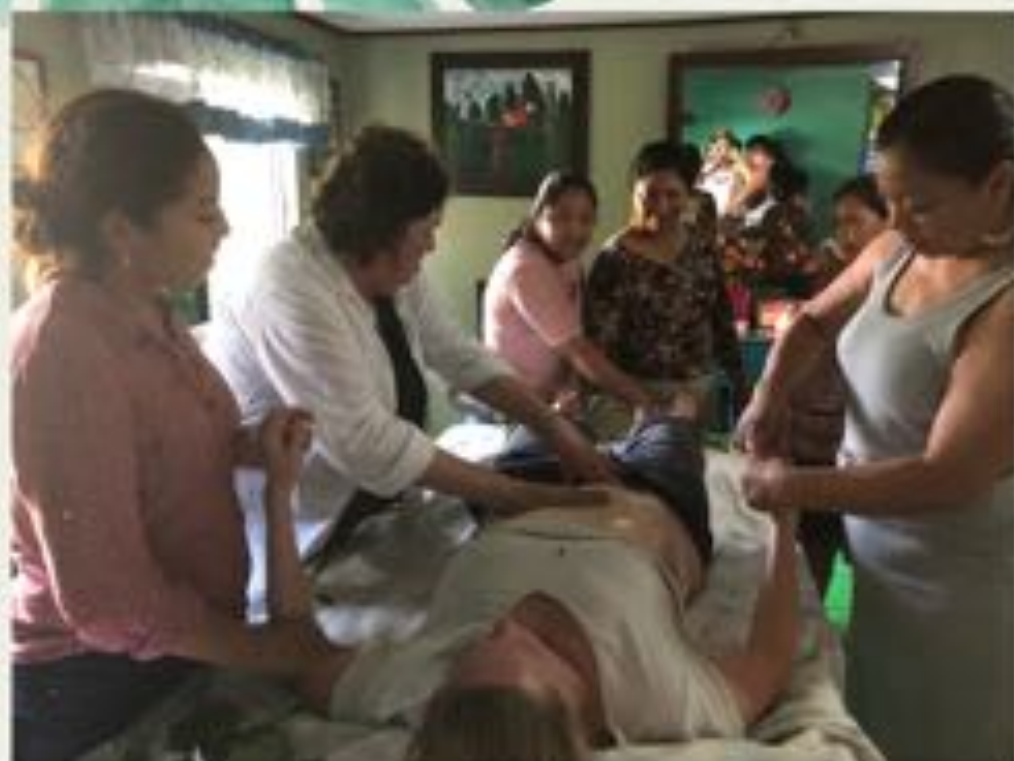
Practicing Maya abdominal massage