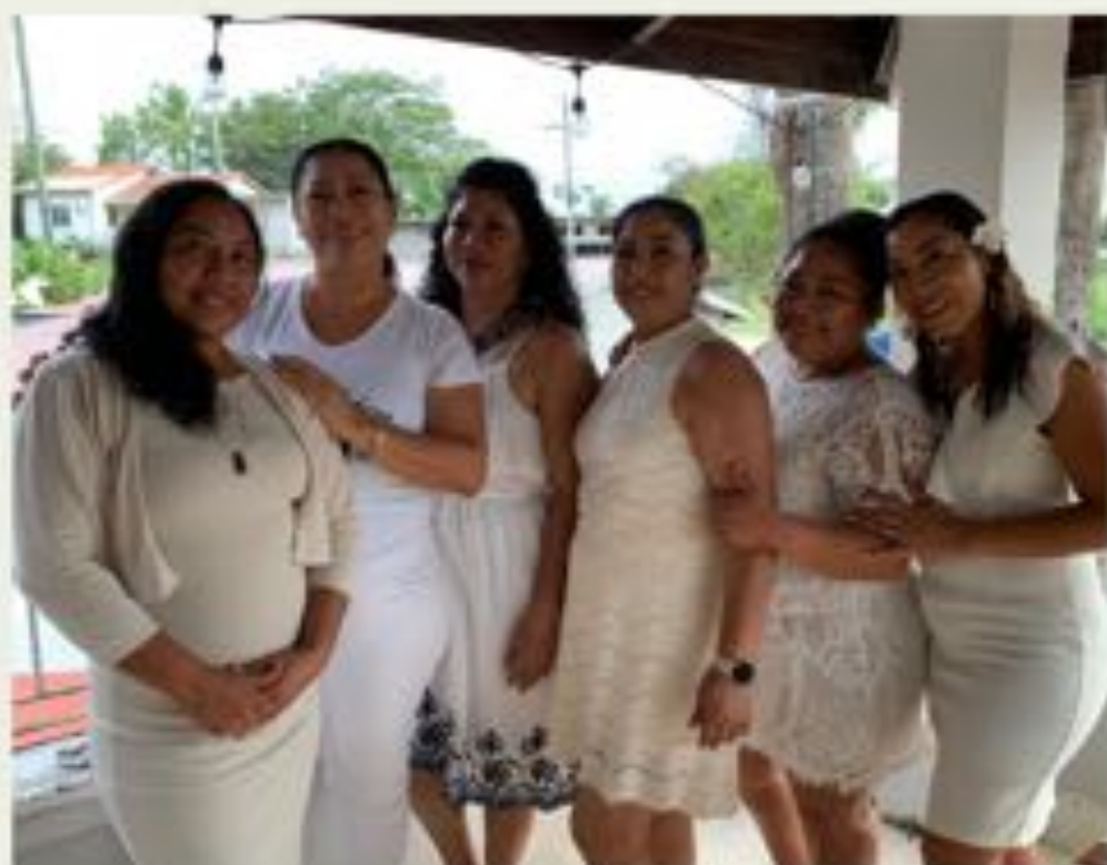
Miss Beatrice's six daughters led the Primicia ceremony